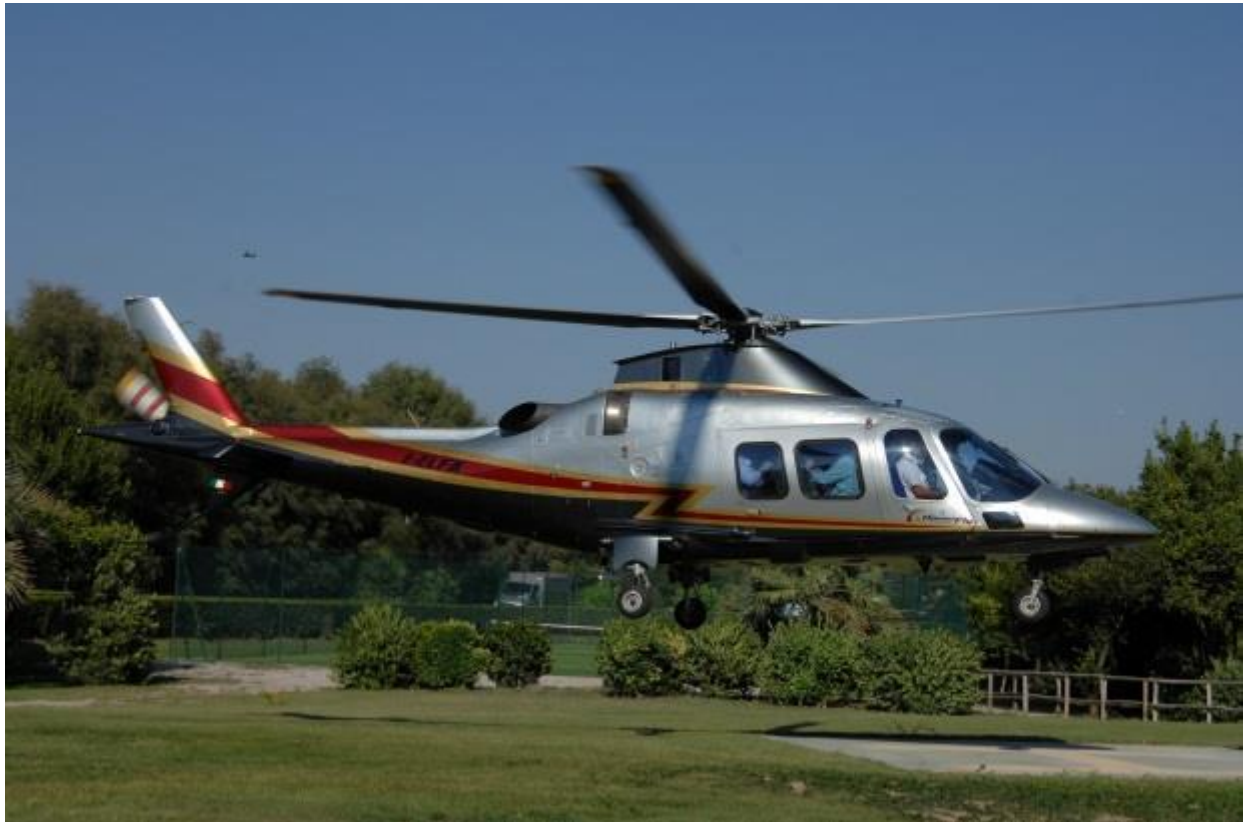
Agusta Westland A109S – Grand – Twin Engine was manufactured on 2007